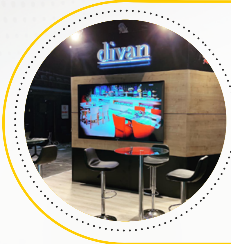
Divan Volkswagen Arena | May 2019