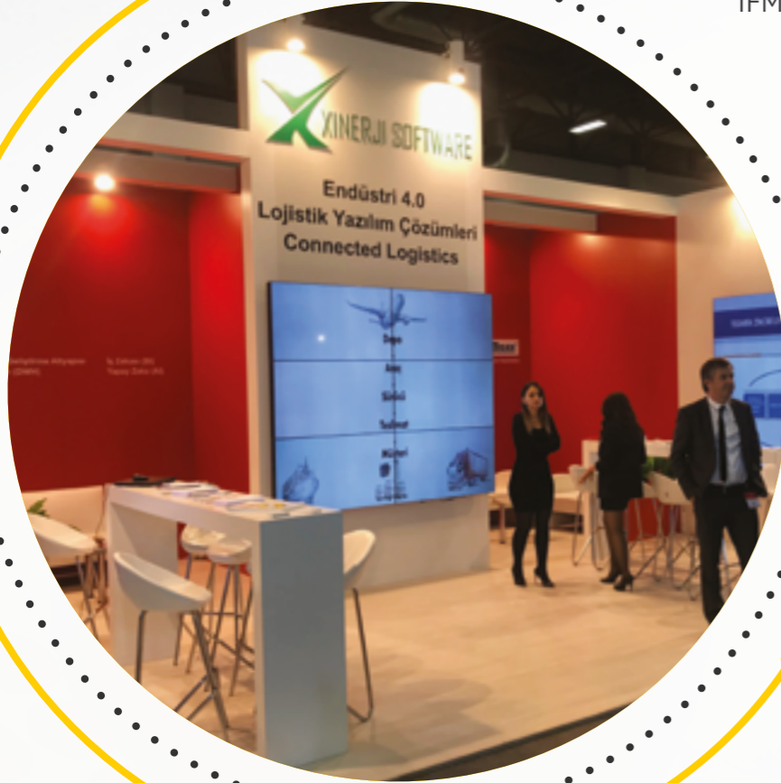
Xinerji Technologies İFM Logitrans | November 2018