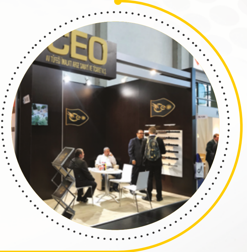
CEO Av Tüfeği Arge Sanayi Ticaret A.Ş. IWA Outdoor Classics Nürnberg | March 2018