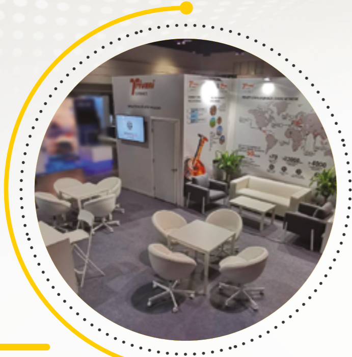
Triveni Turbines Power Gen International Orlando - Florida - USA | December 2018