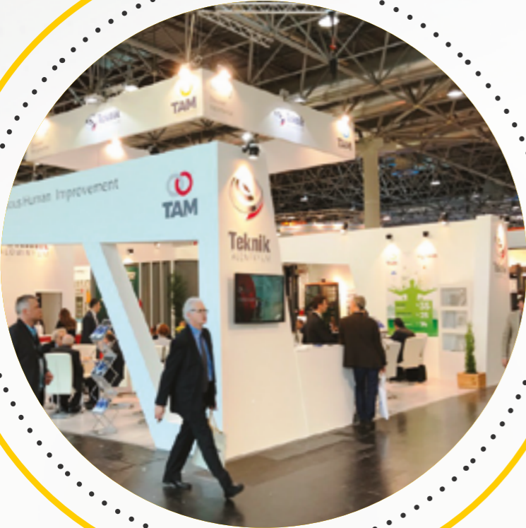
Teknik Alüminyum Düsseldorf Alluminium | November 2016