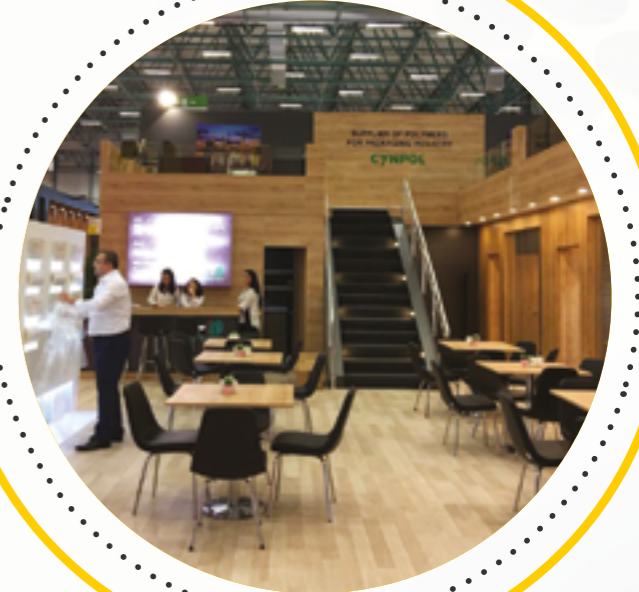
Prime Plastichem Tüyp Plast Eurasia | December 2018