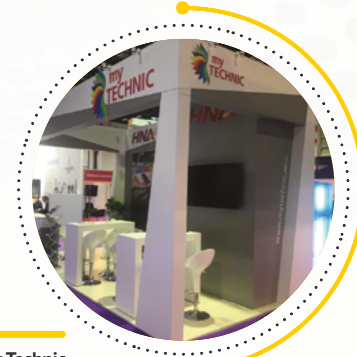
My Technic Dubai MRO Middle East | February 2019