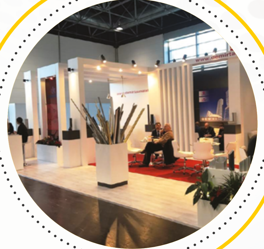
Demirtaş Metal Düsseldorf Alluminium | November 2016