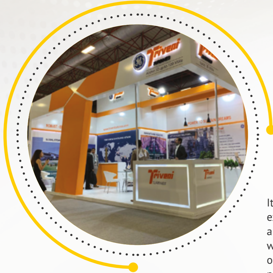
Triveni Turbines İFM ICCI | May 2019

It will make you raise your expectations for domestic and abroad fair organizations when you work with an organised experienced partner who has the knowledge and works for reflecting your brand and image in the right way.